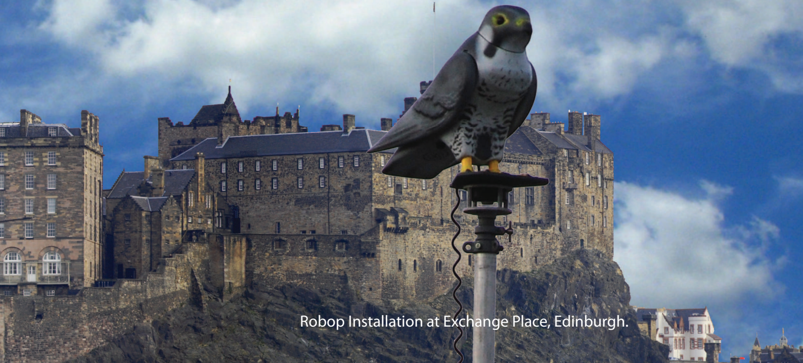
Robop Installation at Exchange Place, Edinburgh.

Since 2001 Robop has gone from a Scottish inventor's spark of genius to a robust British made product installed in 15 countries. As a company we are passionate about what we do, proud of what we've achieved, and are dedicated to solving your bird control problems.